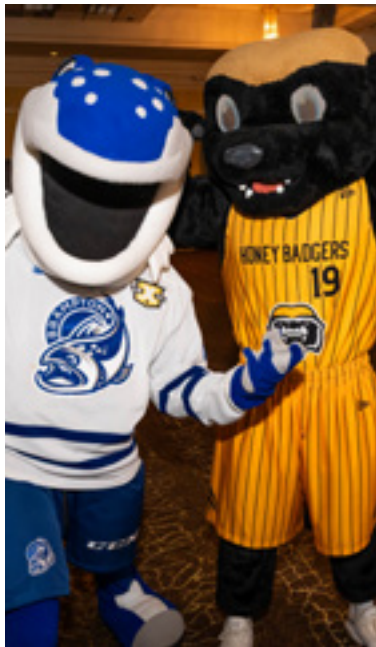
Did you know the Brampton Honey Badgers is a local professional basketball team competing in the Canadian Elite Basketball League? And did you know the Brampton Steelheads are a Canadian junior ice hockey team in the Ontario Hockey League, also based in our city? Bring your friends and family to one of their games and join these fun mascots in cheering on our home teams! (January 2025)