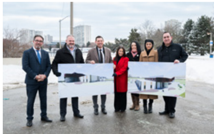
As part of the City's 2025 Budget process, a brand new Brampton library branch will be added to the updated Howden Recreation Centre. Libraries are home to more than just books – they're community hubs for learning, creativity and connection. Whether you're studying, exploring new ideas or seeking a quiet space, libraries provide invaluable resources for all. (February 2025)