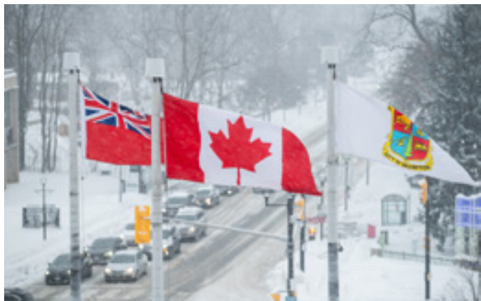
The City of Brampton has adopted a new Made in Canada procurement policy, a firm commitment to support our Canadian businesses in response to the American tariff threats. I encourage you to support our Canadian and Brampton businesses as much as possible – our support prioritizes and strengthens our local economy. Learn more at stand4canada.ca