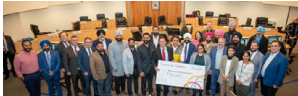
Our friends at 1350 Radio Humsafar raised $85,000 for Brampton's second hospital. This fundraiser was part of a special radio-thon, generating generous donations from callers and donors from across the city. Thank you to everyone who joined and to those who came to announce this achievement in our Council chambers. (December 2024)